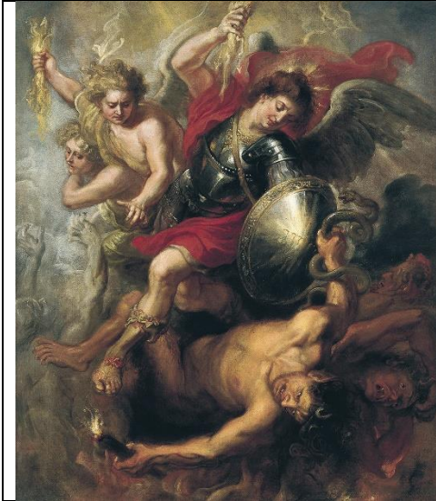
St. Michael expelling Lucifer and the Rebel Angels Peter Paul Rubens (workshop of) Museo Nacional Thyssen-Bornemisza, Madrid

Father God, you have the situation in hand. I take unto myself the shield of faith with which I may extinguish all the arrows of the evil one. Keep me safe in the full armour until the time when evil will be destroyed. Amen.